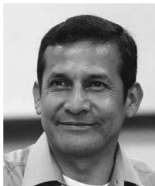
Peru’s new president Ollanta Humala

It is the Aymara culture in the south central area of the country that has risen in protest against mines coming into their area. The Aymara people are a very strong and united group of people. They are the only ones so far that have been able to resist the entrance of the mines. Their belief is that the “pachamama” (mother earth) will be desecrated by the mining companies, and the fate of the people will be disastrous. Dialogue is going on right now among the leaders of the Aymara community and