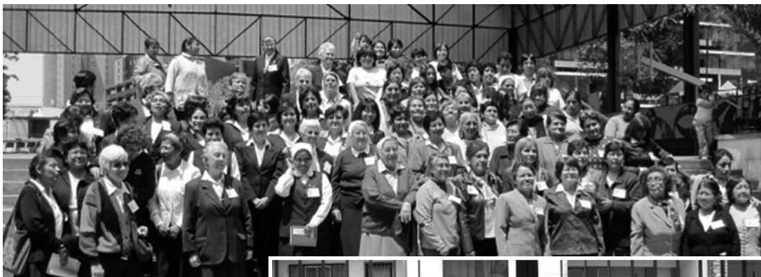
All of the sisters and associates from different groups.

The presentations of that day challenged us to launch our beliefs, our programs, and our planning into the public sector. We cannot exclude ourselves from the reality that teachers in the public sector are experiencing