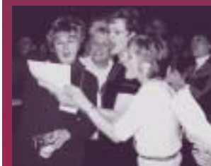
Angela Merici Alums at the homecoming, page 3