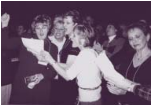
Cheers and the school song raised spirits and voices.