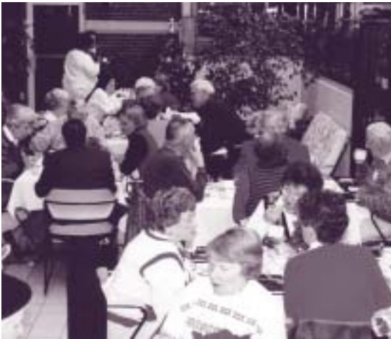
Bargain Barn volunteers enjoy a farewell lunch.

Volunteers who have given so much of their time to the Bargain Barn ministry were recognized with a December luncheon. The Bargain Barn operated on the Ursuline campus for 25 years, with proceeds from the sale of donated items benefiting Marian Home. With the Bargain Barn's closing due to traffic and safety concerns, we will realize a shortfall in funds benefiting Marian Home. We will be looking to our benefactors to help us supplement this revenue loss. For information on how you can help, call the Office of Development at (502) 896-3938.